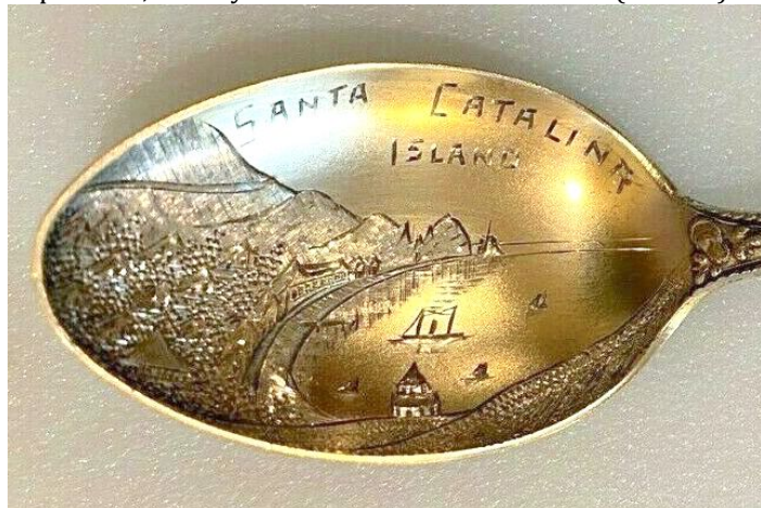
on Watson #337 – nautical themes